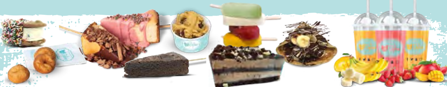
Donuts • Ice Cream Sandwiches • Cheesecake • Brownies • Cookie Dough • Chocolate Crepes • Bananas • Smoothies

proudly Serving The Cheesecake Factory BAKERY.